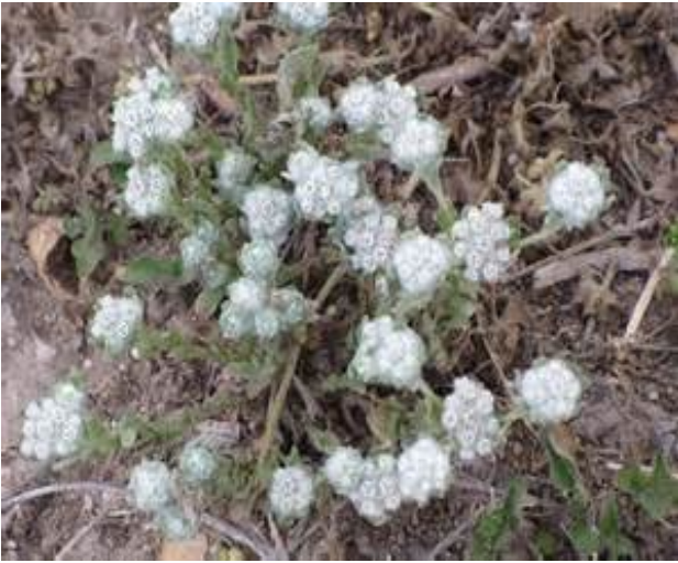
Rabbit Tobacco (Diaperia Verna)