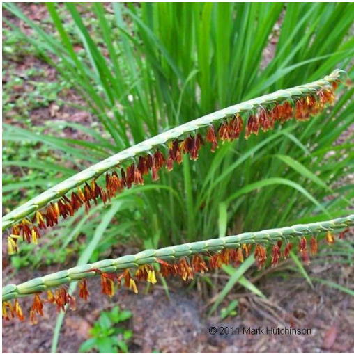
Eastern Gamagrass (Tripscaum Dac-)