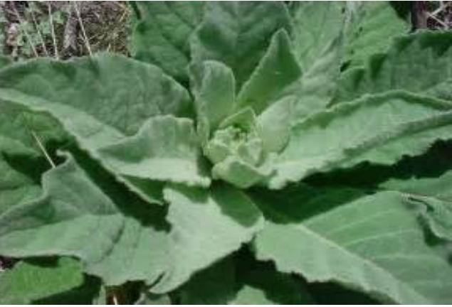
Wild Mullein (Verbascum Thapsus)