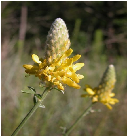
Golden Dalea (Dalea Aurea) (left)